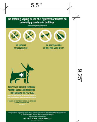
Custom building decal (For Industrial Sciences building and Military Sciences Building, which have narrow windows on main entry doors)