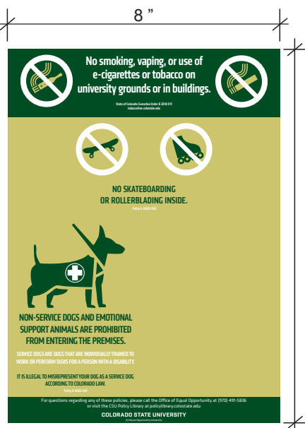
Standard building decal