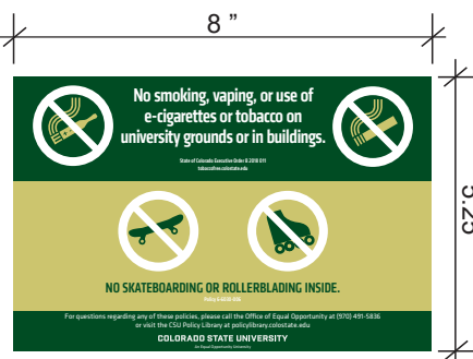
Building decal - with NO service dog (for buildings whose function involves animals such as DMC, Flint Animal Cancer Center)