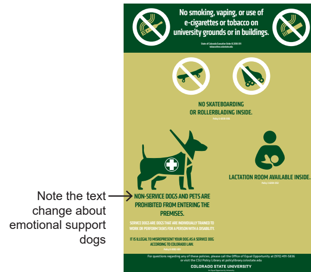
New HDS standard “No Smoking” WITH lactation room symbol decal (This applies to certain HDS buildings such as residence halls because of their separate animal policy; buildings include a lactation room)