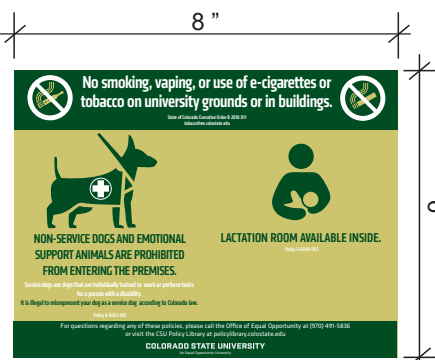
Building decal - with NO service dog WITH lactation room symbol (for buildings whose function involves animals such as VTH)