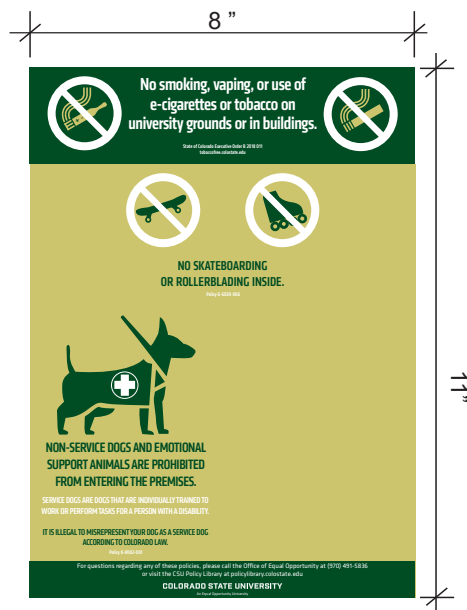
New standard “No Smoking” decal (This is the new CSU no smoking standard decal on all non-HDS buildings on campus)