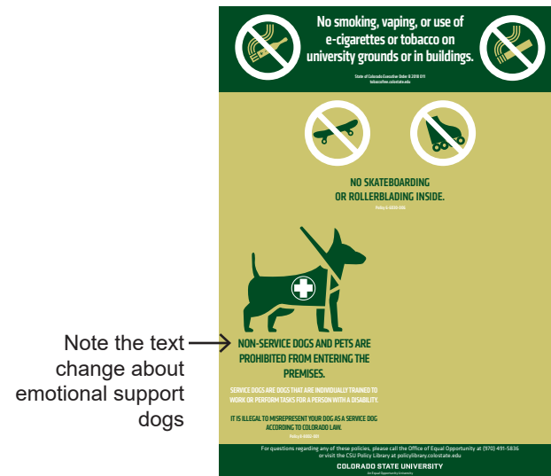
New HDS standard “No Smoking” decal (This applies to certain HDS buildings such as residence halls because of their separate animal policy)