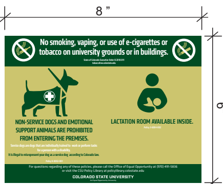
Building decal - without skateboard/rollerblade WITH lactation symbol (such as Arkansas Valley Ag Research Center)