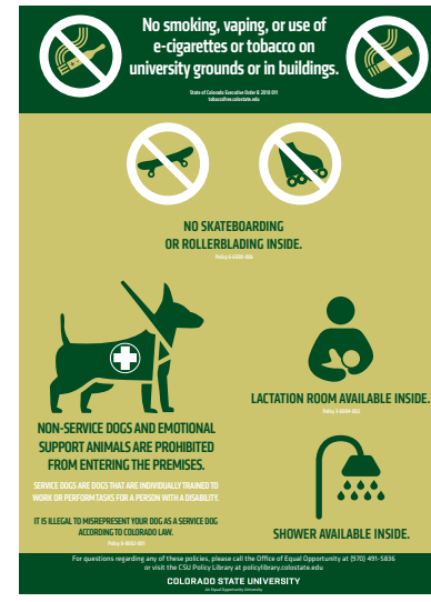
Building decal - with lactation room and shower symbol