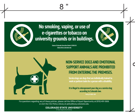
Building decal - without skateboard/rollerblade (for more "rural" buildings/ areas such as Mountain Campus, Extension offices, and Ag Research Centers)