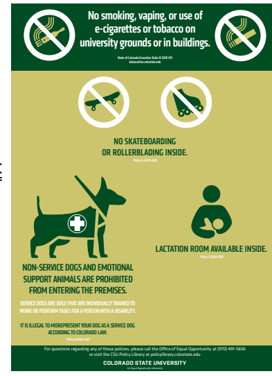
Building decal - with lactation room symbol