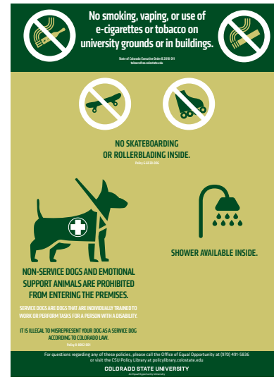
Building decal - with shower symbol