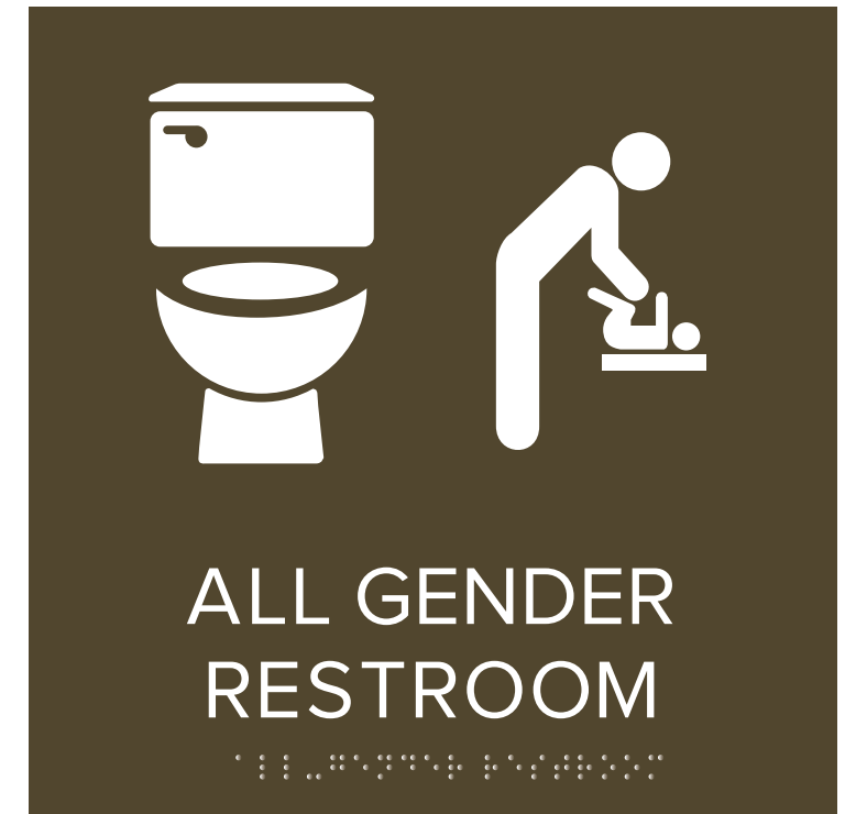
All Gender Restroom with Changing Table Sign