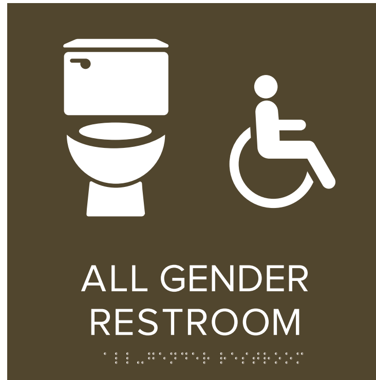
All Gender ADA-Accessible Restroom Sign