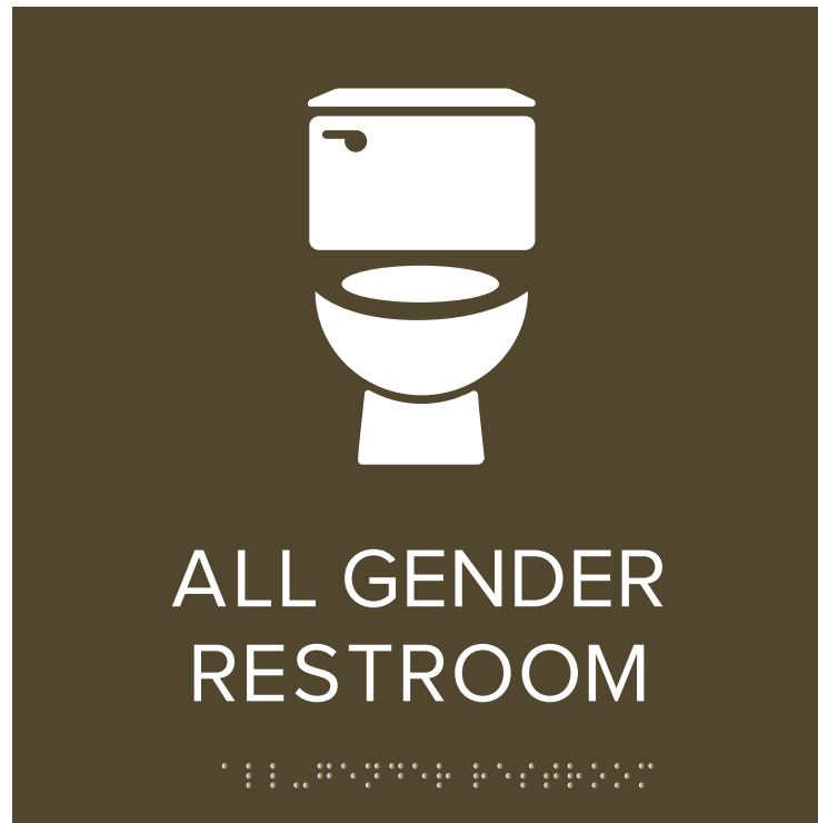
All Gender Restroom Sign

Restrooms with an adult changing table and/or “no automatic hand dryers/loud noises” shall have separate signs for each of those messages. See following pages for those sign standards.