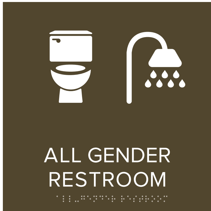
All Gender ADA-Accessible Restroom with Shower Sign