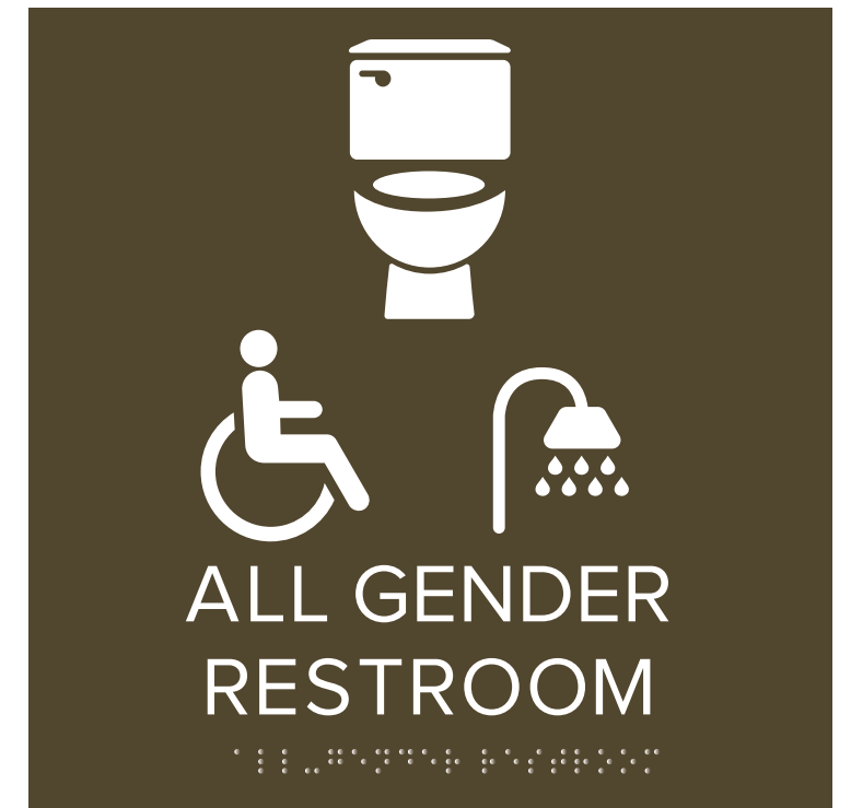
All Gender ADA-Accessible Restroom with Shower Sign

CSU Interior Signage Standards: www.fm.colostate.edu/signage