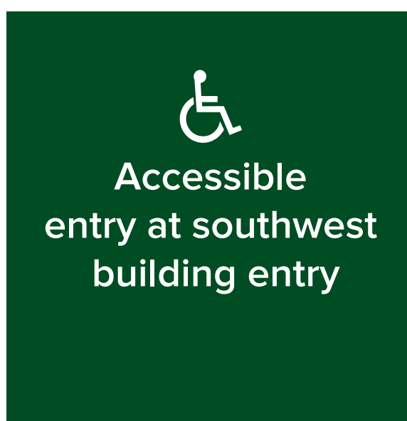
Option without arrow The arrow should be included wherever feasible.

This would need to be included in the required submittal and must be coordinated first with CSU Facilities Management Environmental Graphic Designer