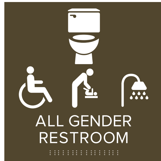
All Gender Accessible Restroom with Changing Table and Shower Sign