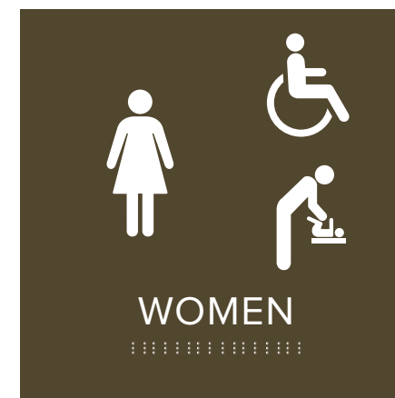
Women’s Restroom with Baby Changing Table Sign

This symbol is not allowed to designate restrooms with a baby changing table or to be labeled as a “family” restroom