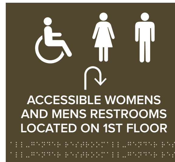
Other possible variations (Size shown remains 1'-0" x 1'-0")