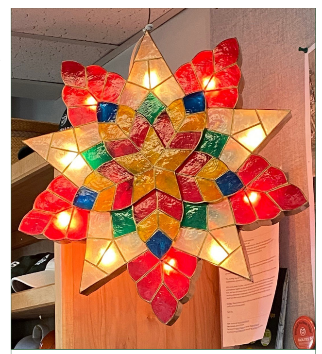
Parol - a Filipino ornamental lantern typically displayed during the Christmas season.

This week also leads into a holiday season that touches the lives of people from many different backgrounds and religions. CSU's Faith, Belief and Religious Observances Calendar is a great resource for learning about the wide diversity of traditions and celebrations that reflect the CSU community: <a href="https://calendar.colostate.edu/observances/">https://calendar.colostate.edu/observances/</a>. As I mentioned last year, holiday decorations are just one way to open valuable communication within our workplaces, allowing us to share what we have in common and also where we differ by talking about why these holidays are significant to us.