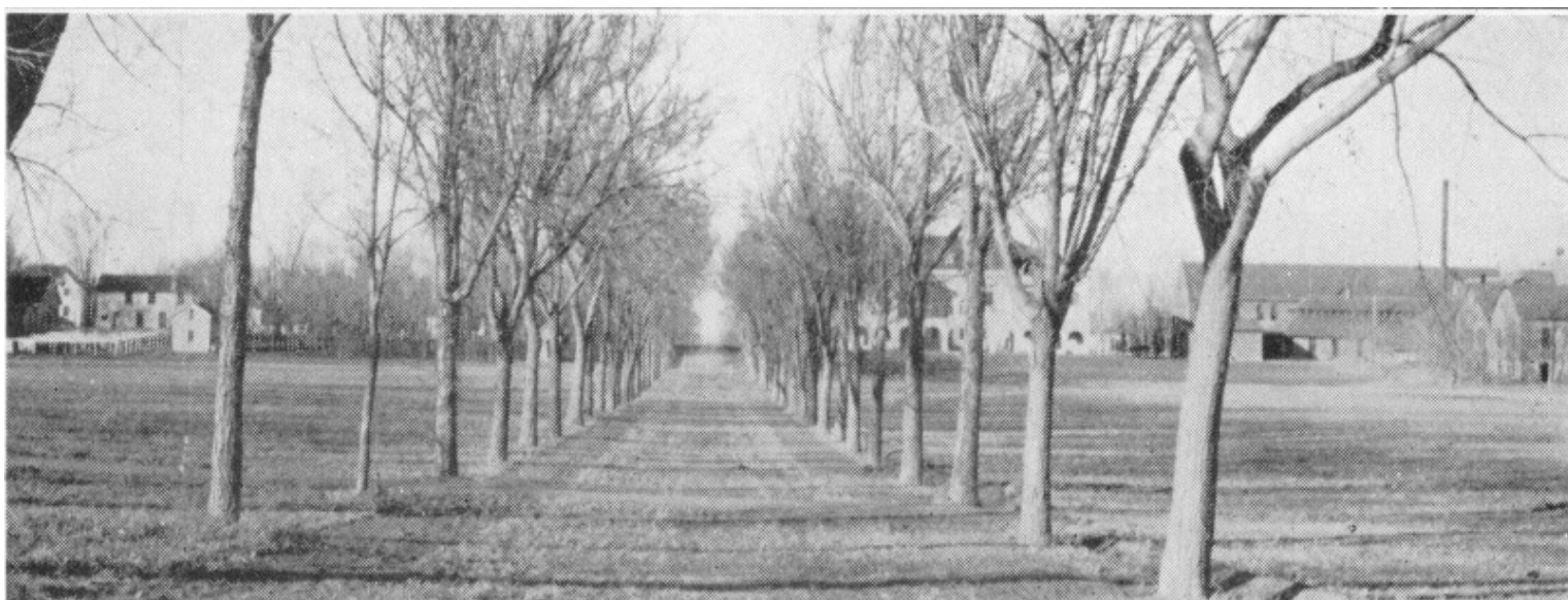
Oval circa 1912