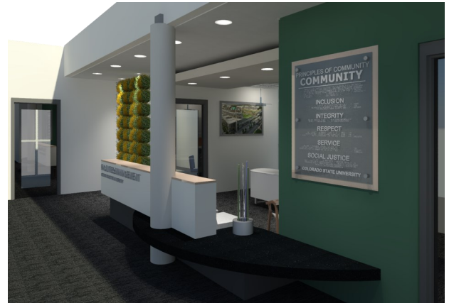
Reception area design outside Edison Conference Room

Foothills custodial office on Rampart Rd. has been remodeled to be the home base of operations for the Foothills Campus.