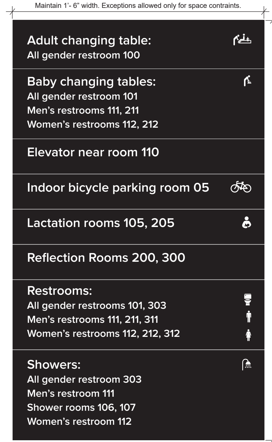
Example of interior directory sign with all inclusive spaces/elements locations

Height varies. Individual sign panels should be designed in increments of 0.5" heights. Min. 2" ht. for any individual sign panel.