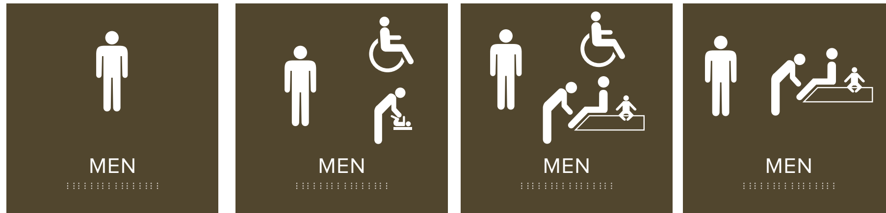
Men's Non-accessible Restroom Sign