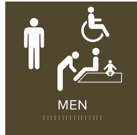
Men's Restroom with Adult Changing Table Sign