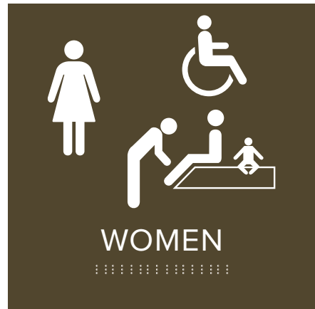
Women's Restroom with Adult Changing Table Sign