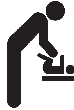
CSU standard symbol to designate restrooms with a changing table (“family” restrooms).