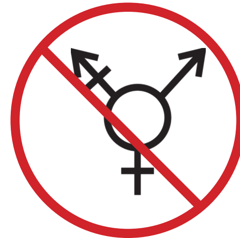
This symbol is not allowed to direct people to restrooms nor to designate all gender restrooms/facilities.