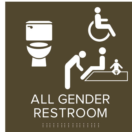
All Gender ADA-Accessible Restroom with Adult Changing Table Sign

CSU Interior Signage Standards: www.fm.colostate.edu/constr_standards