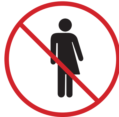
This symbol is not allowed to direct people to restrooms nor to designate all gender restrooms/facilities.