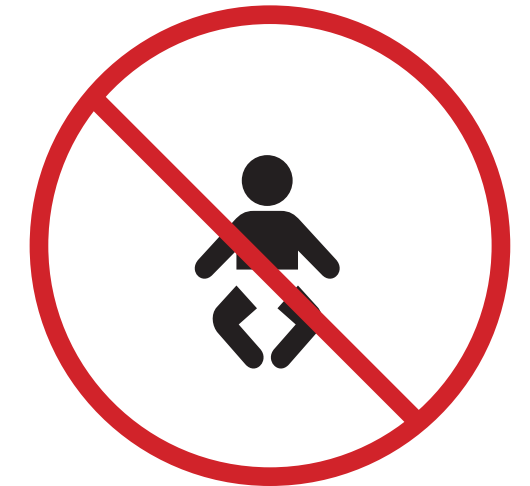
This symbol is not allowed to designate restrooms with a changing table (“family” restrooms). CSU Interior Signage Standards: www.fm.colostate.edu/constr_standards