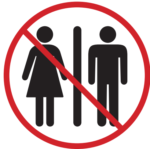
“Binary” combined women and men’s symbols not allowed to direct people to restrooms.