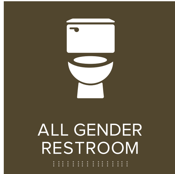
All Gender Restroom Sign

Restrooms with “no automatic hand dryers/loud noises” shall have a separate sign standard for that message.