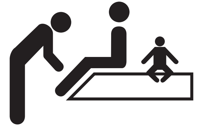
CSU standard symbol to designate an adult changing table