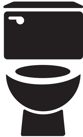
CSU standard symbol for general and all gender restrooms. This symbol should be used to direct people to all restrooms instead of the “binary” combined women and men’s symbols.