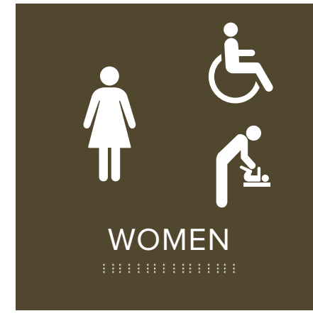
Women's Restroom with Baby Changing Table Sign

This symbol is not allowed to designate restrooms with a baby changing table or to be labeled as a “family” restroom