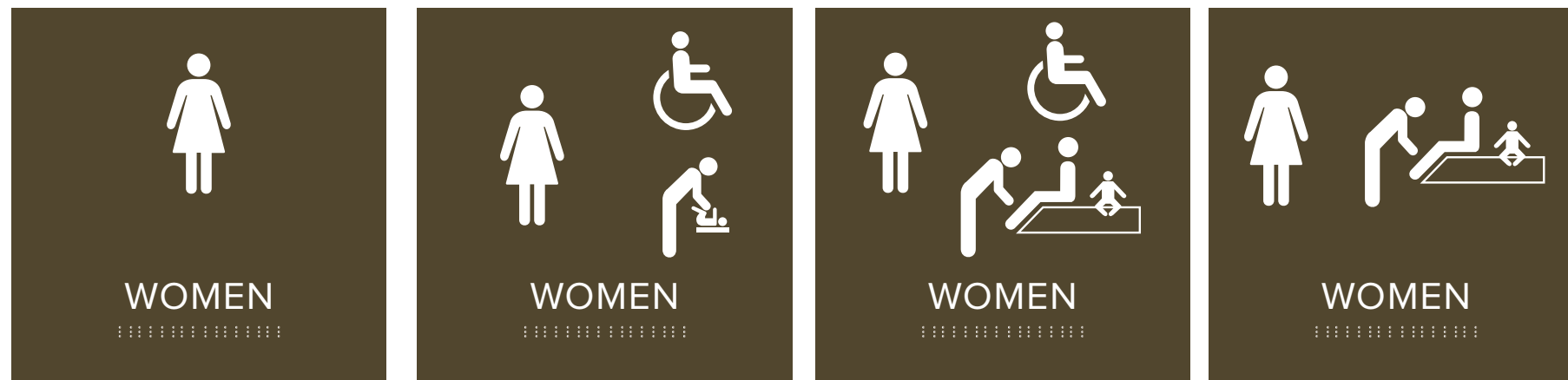
Women's Non-accessible Restroom Sign